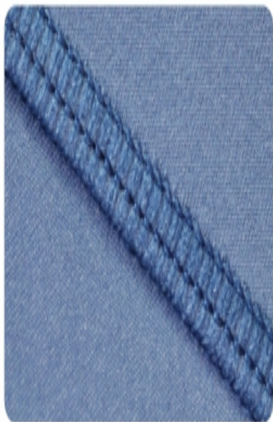
3 needle and 5 thread