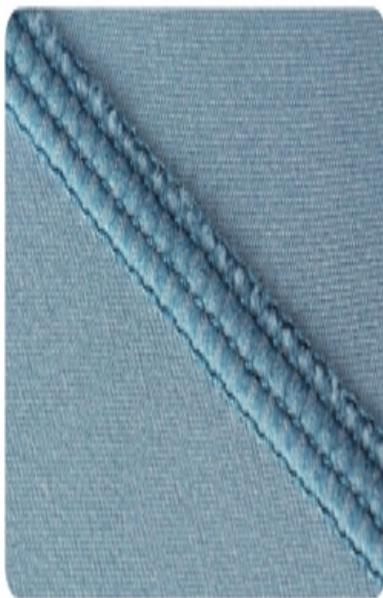
4 needle and 6 thread